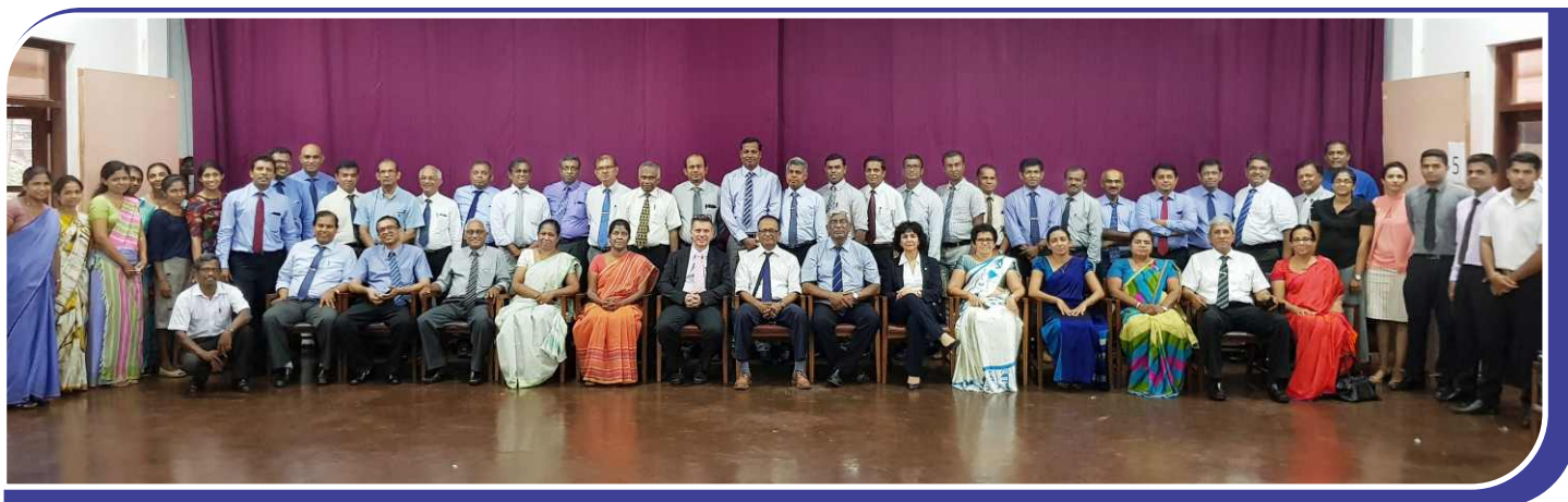
Panel of MD examiners at Faculty Of Medicine, University of Kelaniya